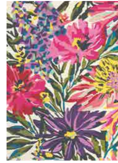
FLOREALE fuchsia 044905