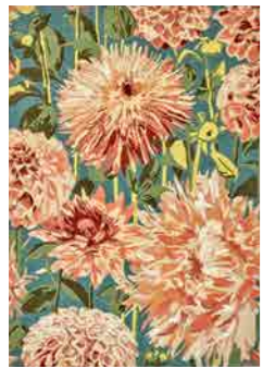
DAHLIA coral/wilderness 142408