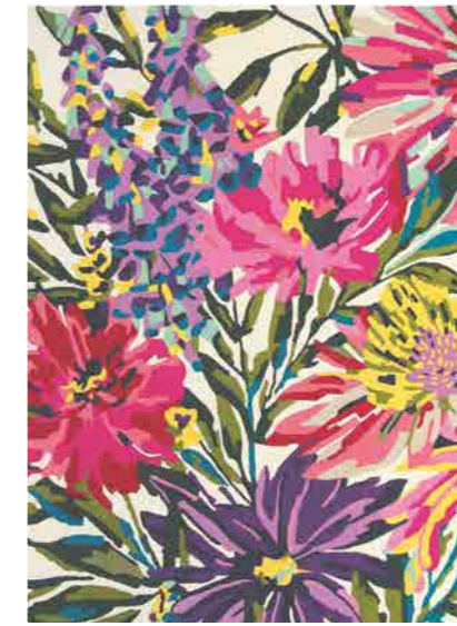
FLOREALE fuchsia 044905