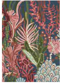
ACROPORA brazilian rosewood/tree canopy 442202