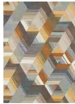
ARCCOS ochre 040206