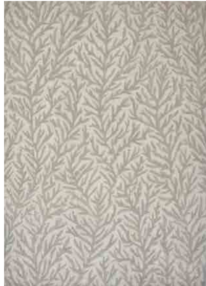
ATOLL hempseed/shell 142504