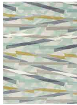
DIFFINITY topaz 140006