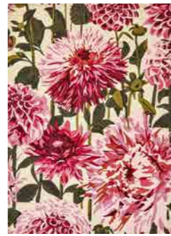
DAHLIA fuchsia/palm 142402