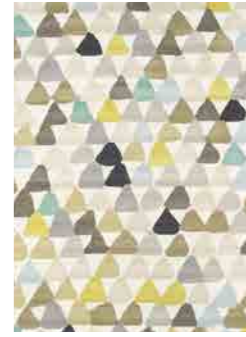
LULU pebble 044601