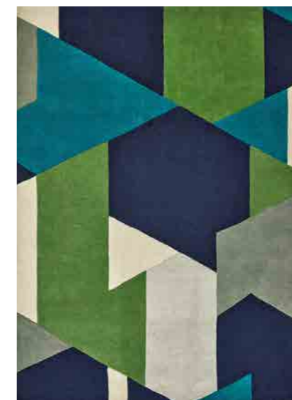
POPOVA amazonia/sea glass/forest/japanese ink 143108