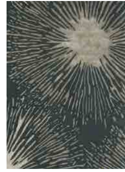
SHORE truffle 040605