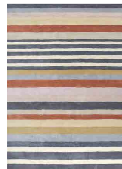
ROSITA harissa 140402