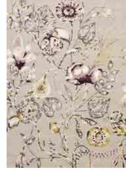
QUINTESSANCE heather 041801