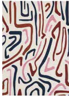
SYNCHRONIC orchid/brazilian rosewood/origami 442303