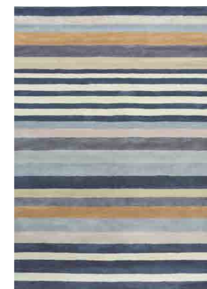
ROSITA putty 140404