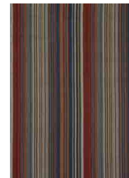
SPECTRO STRIPES teal/sedonia/rust 442103