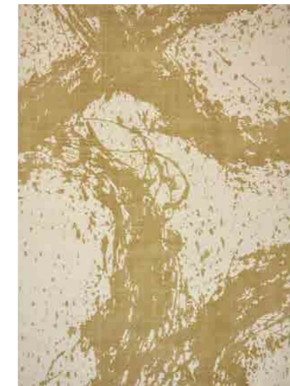
ENIGMATIC sahara/awakening 143306

140x200 cm 4'7" x 6'7" 170x240 cm 5'7" x 7'10" 200x280 cm 6'7" x 9'2" 250x350 cm 8'2" x 11'6"