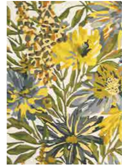
FLOREALE maize 044906