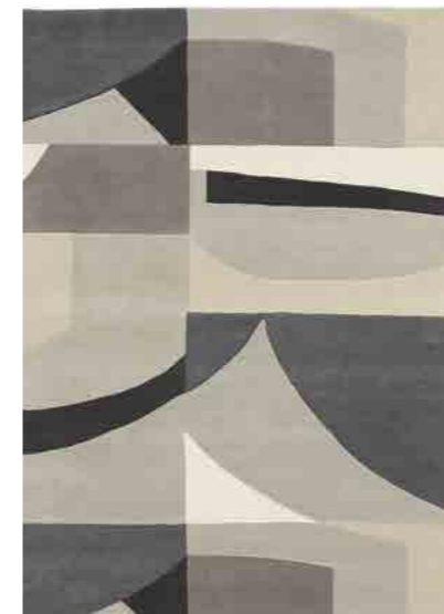
BODEGA stone 040504

140x200 cm 4'7" x 6'7" 170x240 cm 5'7" x 7'10" 200x280 cm 6'7" x 9'2" 250x350 cm 8'2" x 11'6" custom sizes