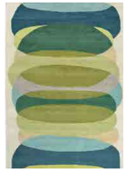
ELLIPTIC emerald 140307