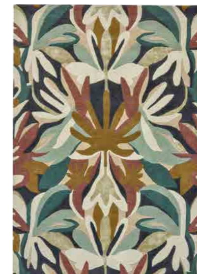
MELORA positano/succulent/gold 142702