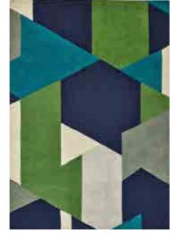
POPOVA amazonia/sea glass/forest/japanese ink 143108