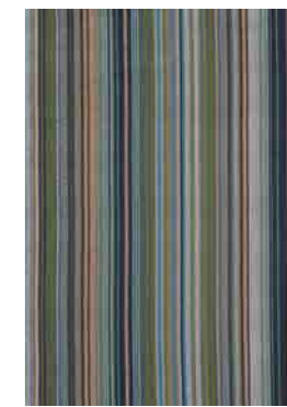
SPECTRO STRIPES emerald/marine/rust 442108