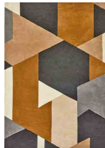
POPOVA caramel/slate/shell 143101