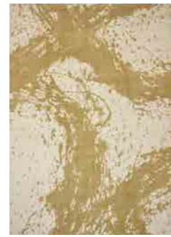
ENIGMATIC sahara/awakening 143306