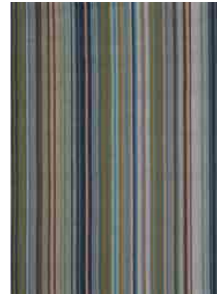
SPECTRO STRIPES emerald/marine/rust 442108