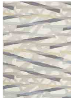
DIFFINITY oyster 140001