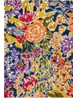
SANGUINE aubergine/palm/apricot/indigo 143205