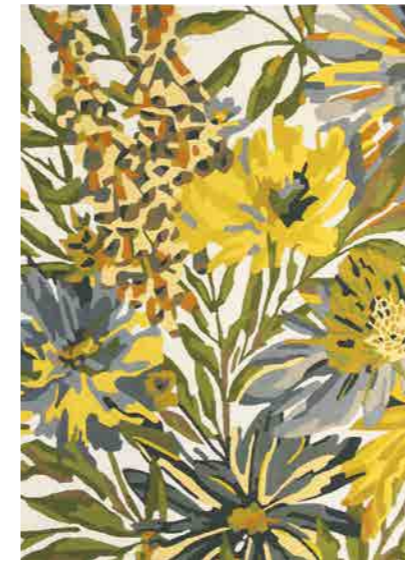
FLOREALE maize 044906