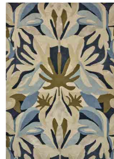
MELORA hemsheed/exhale/gold 142701