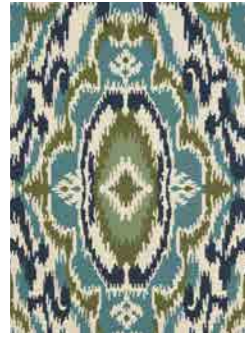
IXORA emerald/palm/chartreuse 442007