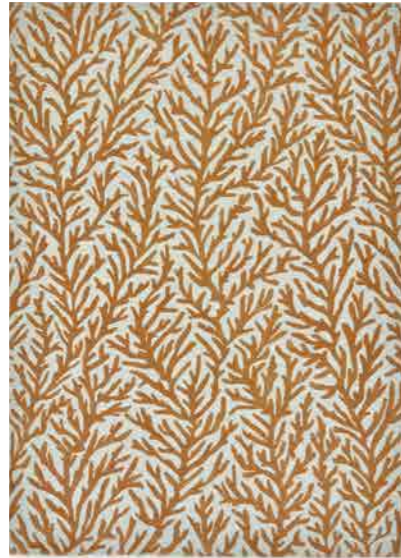
ATOLL auburn/stone 142500