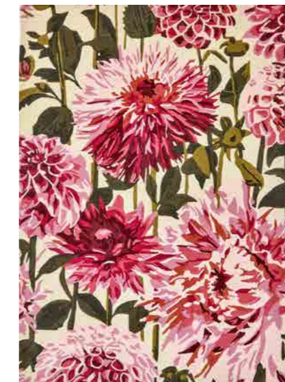
DAHLIA fuchsia/palm 142402

140x200 cm 4'7" x 6'7" 170x240 cm 5'7" x 7'10" 200x280 cm 6'7" x 9'2" 250x350 cm 8'2" x 11'6" custom sizes