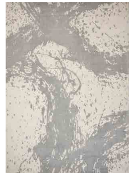
ENIGMATIC pewter/awakening 143304