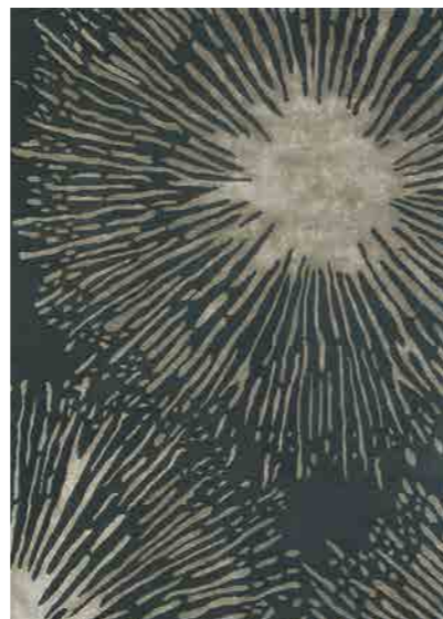
SHORE truffle 040605