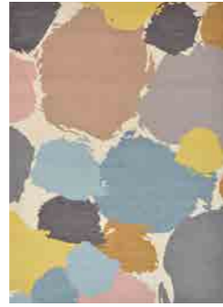
PALETTO shore 444204