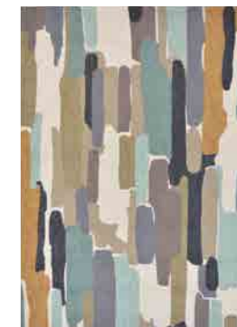
TRATTINO sea glass 444804