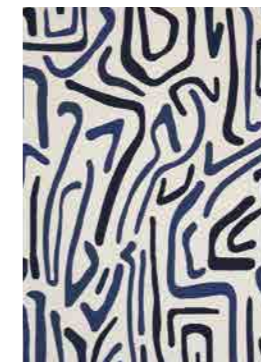
SYNCHRONIC japanese ink/origami 442308