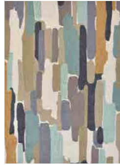
TRATTINO sea glass 444804