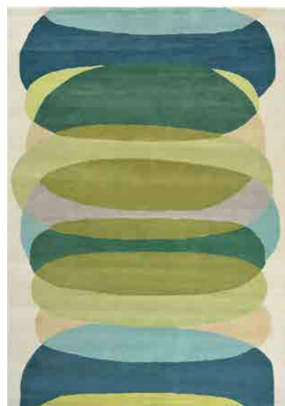
ELLIPTIC emerald 140307