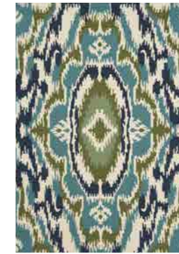
IXORA emerald/palm/chartreuse 442007