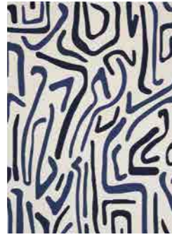
SYNCHRONIC japanese ink/origami 442308