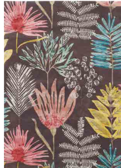
YASUNI cerise 040405

140x200 cm 4'7" x 6'7" 170x240 cm 5'7" x 7'10" 200x280 cm 6'7" x 9'2" 250x350 cm 8'2" x 11'6" custom sizes