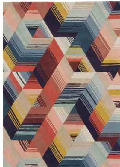
ARCCOS neptune 040205

140x200 cm 4'7" x 6'7" 170x240 cm 5'7" x 7'10" 200x280 cm 6'7" x 9'2" 250x350 cm 8'2" x 11'6" custom sizes