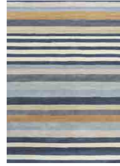
ROSITA putty 140404