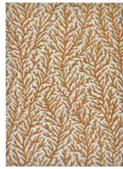
ATOLL auburn/stone 142500