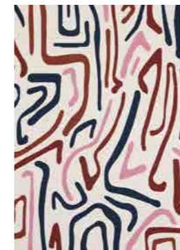
SYNCHRONIC orchid/brazilian rose- wood/origami 442303