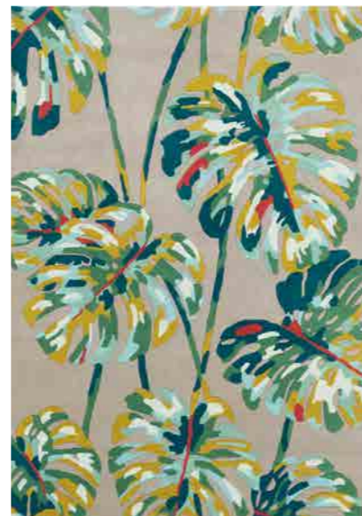
KELAPA zest 040307