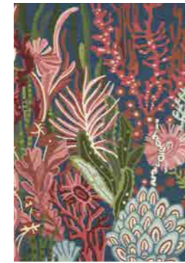
ACROPORA brazilian rosewood/tree canopy 442202

140x200 cm 170x240 cm 200x280 cm 250x350 cm 4'7" x 6'7" 5'7" x 7'10" 6'7" x 9'2" 8'2" x 11'6"