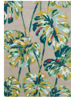
KELAPA zest 040307