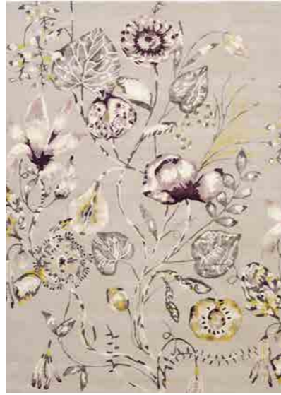
QUINTESSENCE heather 041801

140x200 cm 4'7" x 6'7" 170x240 cm 5'7" x 7'10" 200x280 cm 6'7" x 9'2" 250x350 cm 8'2" x 11'6" custom sizes