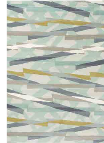
DIFFINITY topaz |40006