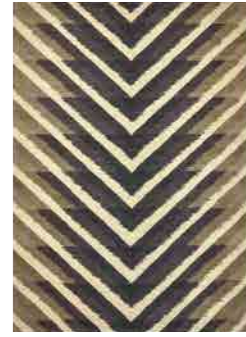
MAKALU flint 142605