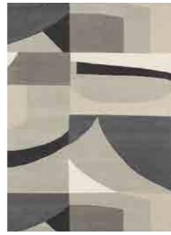
BODEGA stone 040504