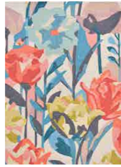
VERDACCIO coral 442802