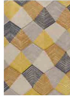
RHYTHM saffron 040906