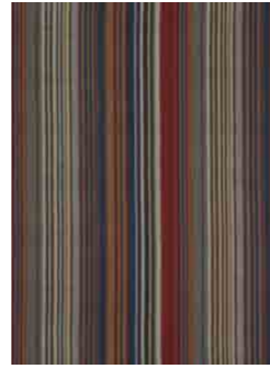
SPECTRO STRIPES teal/sedonia/rust 442103