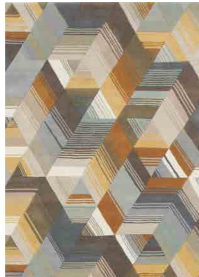
ARCCOS ochre 040206