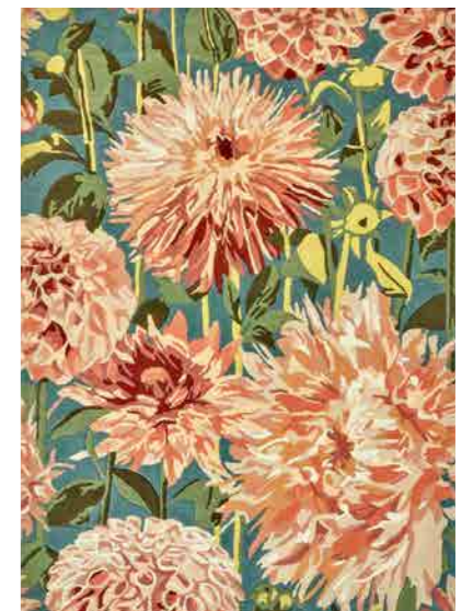
DAHLIA coral/wilderness 142408