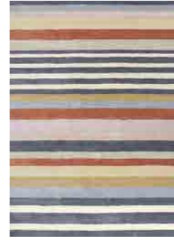
ROSITA harissa 140402