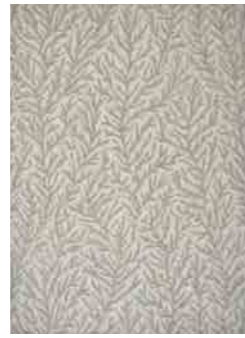
ATOLL hempseed/shell 142504