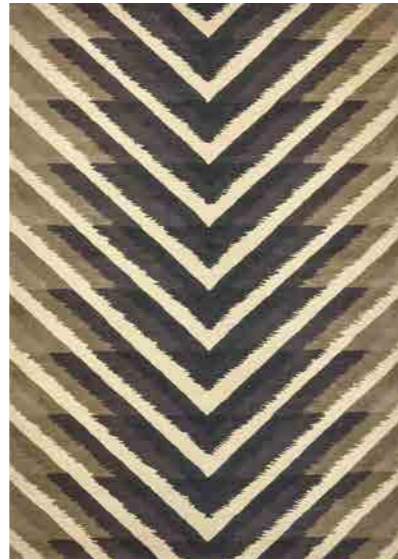
MAKALU flint 142605

140x200 cm 4'7" x 6'7" 170x240 cm 5'7" x 7'10" 200x280 cm 6'7" x 9'2" 250x350 cm 8'2" x 11'6" custom sizes