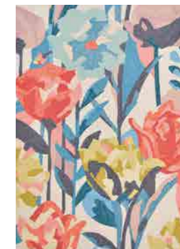
VERDACCIO coral 442802