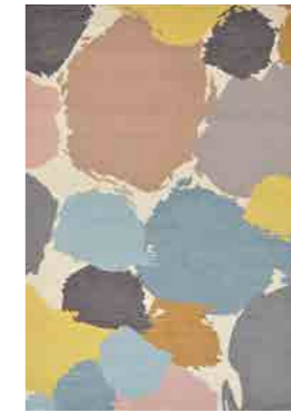
PALETTO shore 444204