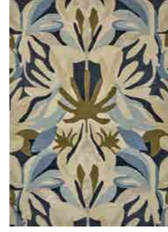
MELORA hempseed/exhale/gold 142701