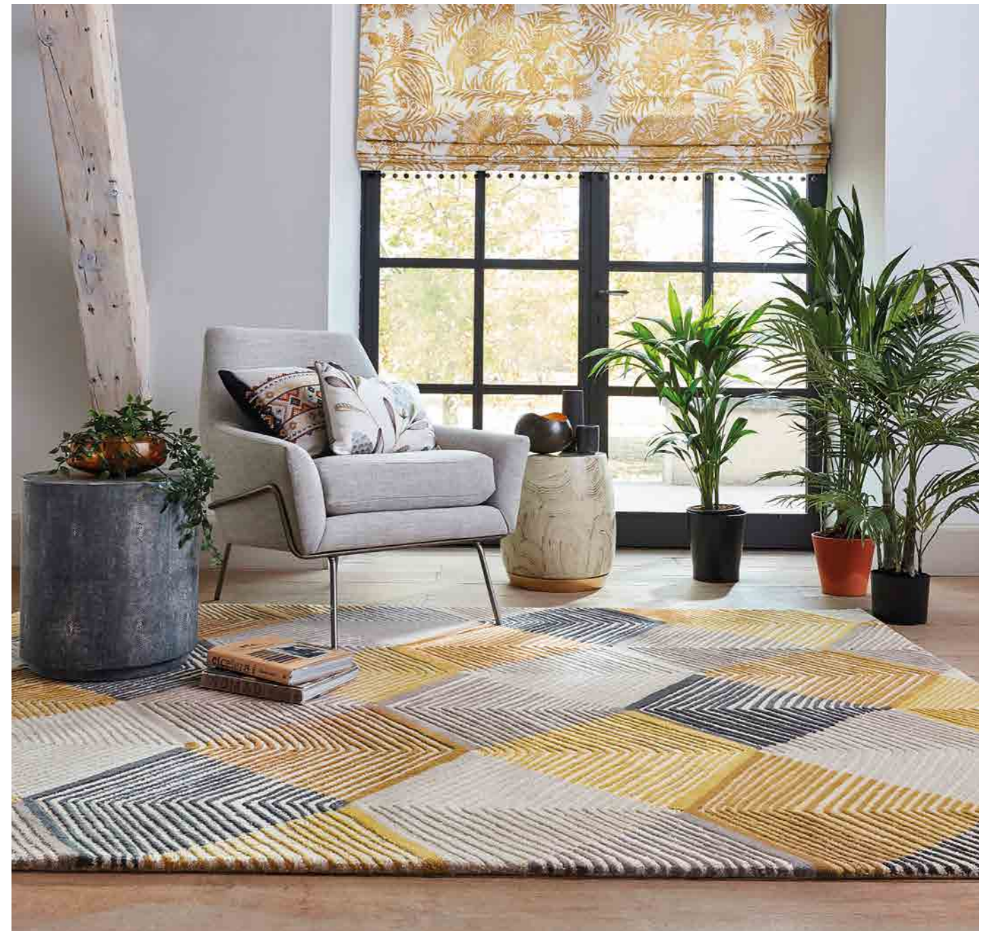
RHYTHM saffron 040906

140x200 cm 4'7" x 6'7" 170x240 cm 5'7" x 7'10" 200x280 cm 6'7" x 9'2" 250x350 cm 8'2" x 11'6" custom sizes