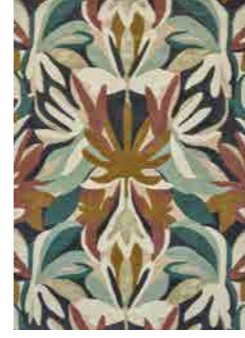
MELORA positano/succulent/gold 142702