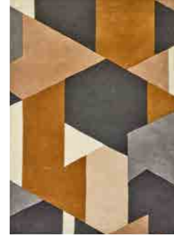
POPOVA caramel/slate/shell 143101