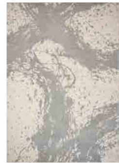
ENIGMATIC pewter/enigmatic 143304