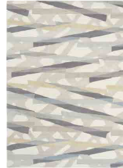
DIFFINITY oyster |40001