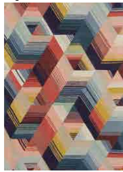
ARCCOS neptune 040205